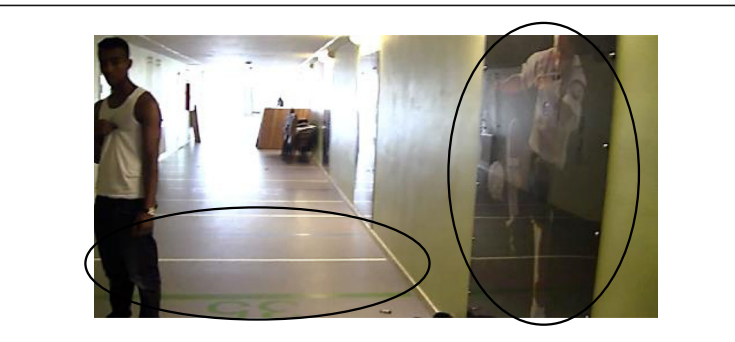
Fig. 9 Decorations on the wall and the floor in the hallway

The hallway is a long space that connects the main building with a multi-purpose hall, toilets, and three specialised classrooms. Figure 9 shows the hallway is a place for storage,