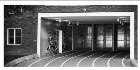
Fig. 10 The school entrance

but there are no chairs, tables, or other furniture suitable for recreation/working available to the students. The hallway is a space for commuting between learning spaces.